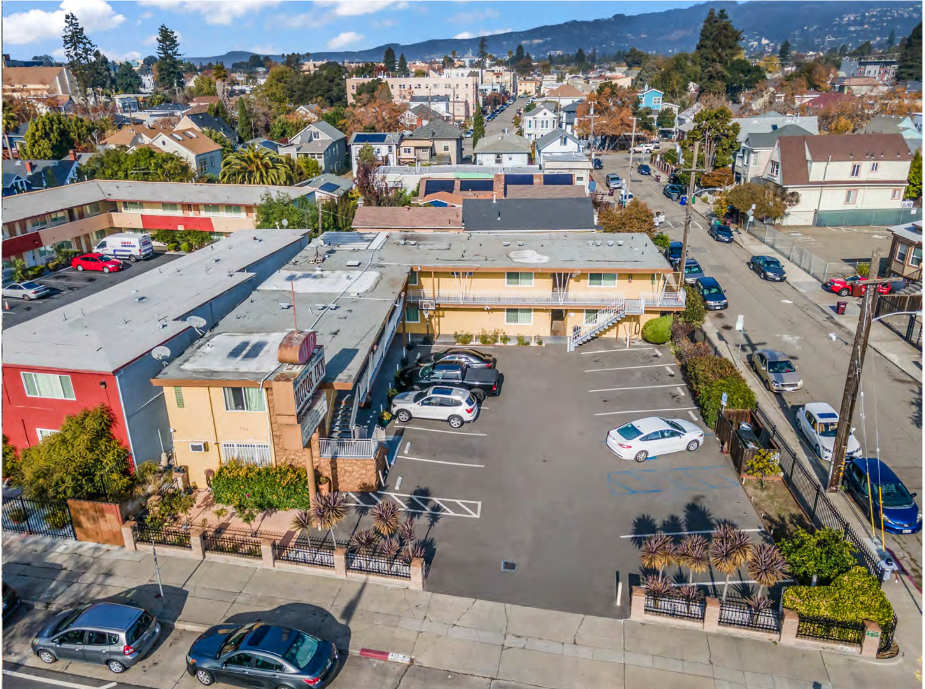
The information contained herein has been obtained from sources we deem reliable. We cannot, however, assume responsibility for its accuracy.