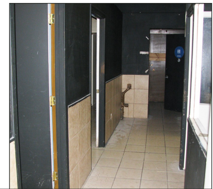
2,231± SF Space