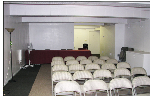
1,200± SF Space—Month-To-Month Tenant