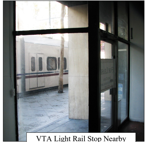
VTA Light Rail Stop Nearby