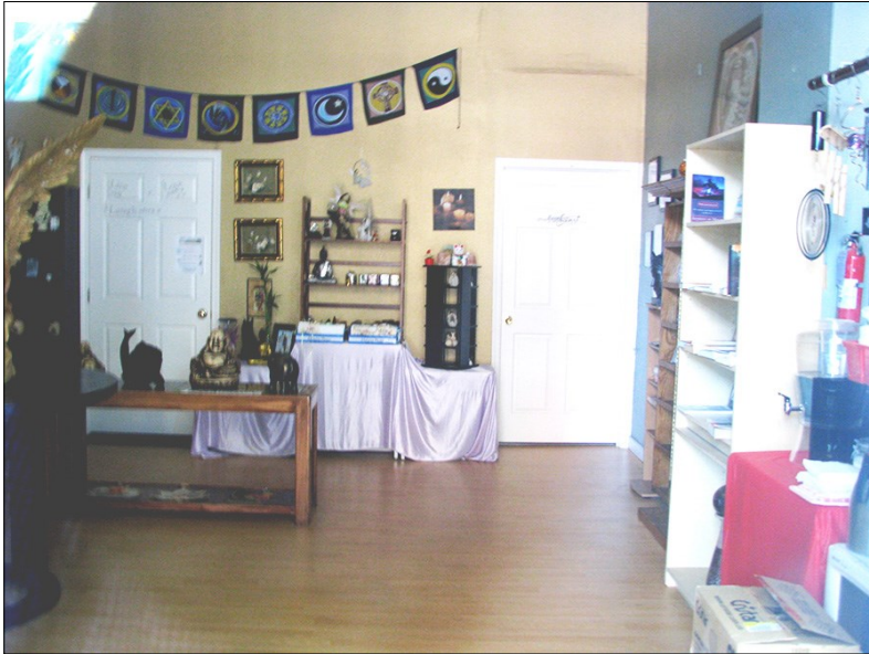
1,200± SF Space—Month-To-Month Tenant